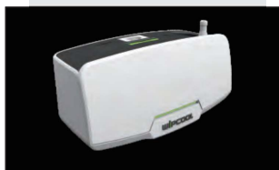
Led running light