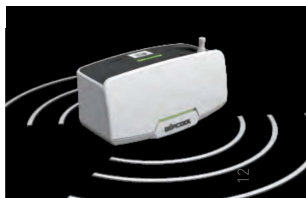
Buzzer fault alarm