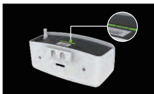
Easy access to installment