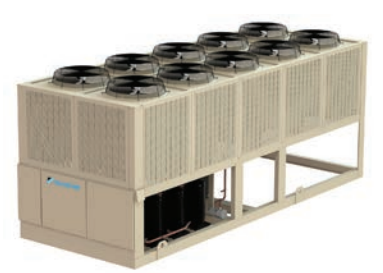
Trailblazer<sup>™</sup> air cooled scroll chiller 30 to 240 tons

Choose a Daikin Trailblazer air cooled scroll chiller